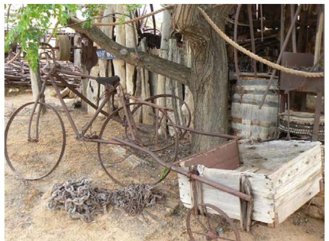
Nor'West Bend Station